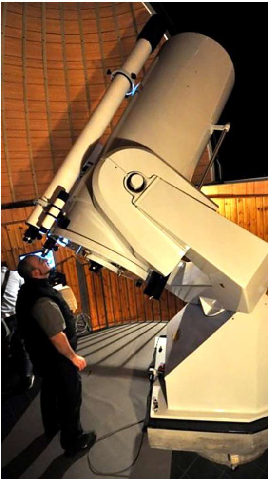
The Alpette telescope