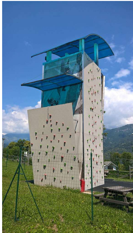
The climbing gym