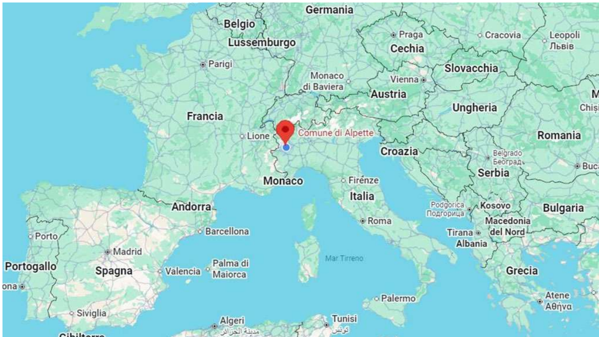
ALPETTE, Torino Province – Piedmont Region – Italy