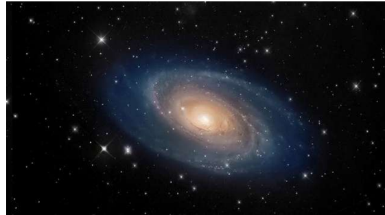
A galaxy seen from the Alpette Telescope