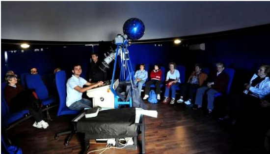
The famous Planetarium